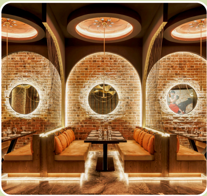
FINE & CASUAL DINING

A truly exclusive and sophisticated experience awaits you at Grand Fiesta Americana Coral Beach, Cancún All Inclusive Spa Resort. In this unique destination, luxury has no limits; this is reflected in each of our spaces and rooms, where first-rate Mexican art, sculpture, and design combine for an unforgettable family vacation or a romantic getaway.