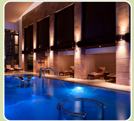
WELLNESS & SPA