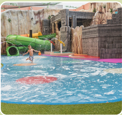
ACTIVITIES FOR ALL AGES