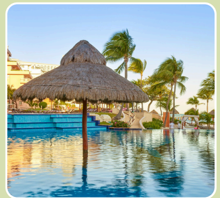
5 STAR ACCOMMODATIONS