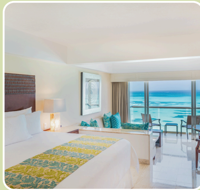
OCEAN VIEW SUITES